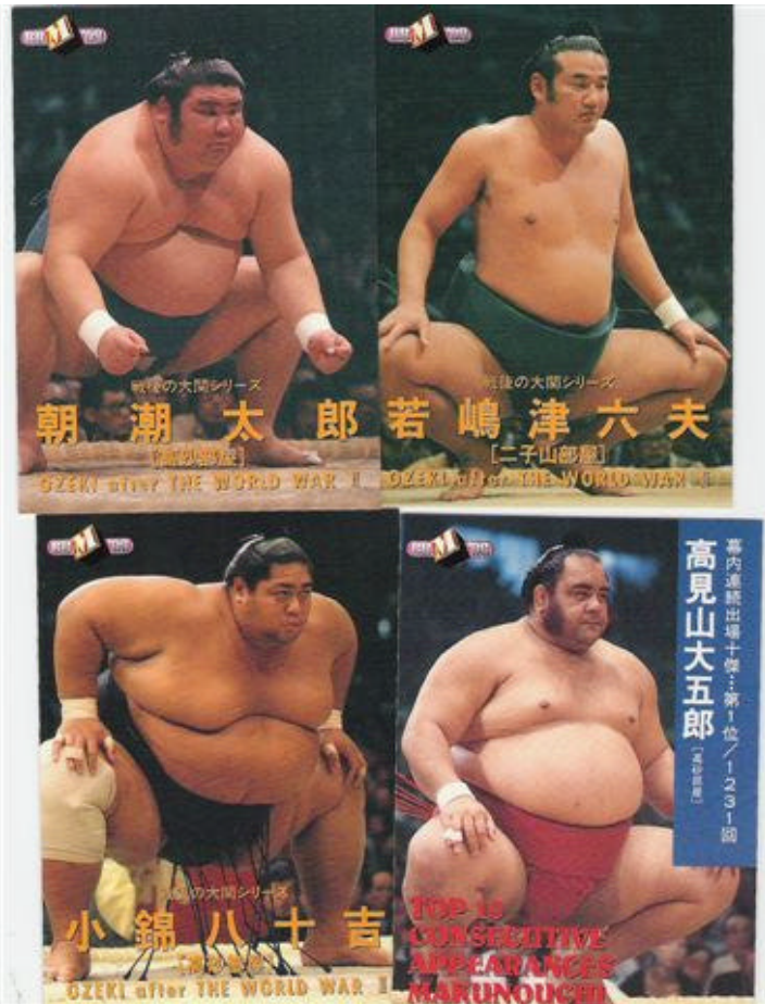
SUMO HISTORY AT YOUR FINGERTIPS... Some of the sumo trading cards acquired by “Tonkatsu” are shown here. Top left: ozeki Asashio Taro. Top right: ozeki Wakashimazu Mutsuo. Bottom left: ozeki Konishiki Tasokichi. Bottom right: sekiwake Takamiyama Daigoro.

We have found several sets on sale, ranging from single cards to a complete set of over forty. So far we have bid on five sets and gotten two. If you decide to check it out, please go to www.goodshop.com and click E-bay. That way, if you win a bid, the United States Sumo Federation gets a cut.