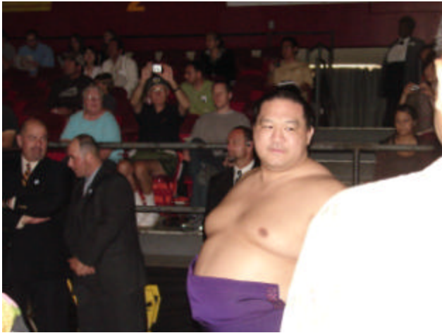
Ozeki KAIO entering the arena for the dohyo-iri at the Grand Sumo koen in Los Angeles. Sumo's new "Iron Man" now has 748 top-division victories.